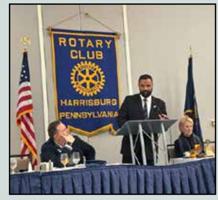
I had the pleasure of representing the 104th Legislative District, discussing my legislative initiatives, and sharing my vision for our future at the Rotary Club of Harrisburg.