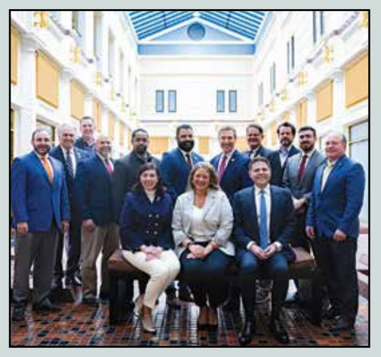
Another successful America 250PA hearing in the books!