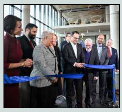
At the ribbon-cutting ceremony for the new state archives building.