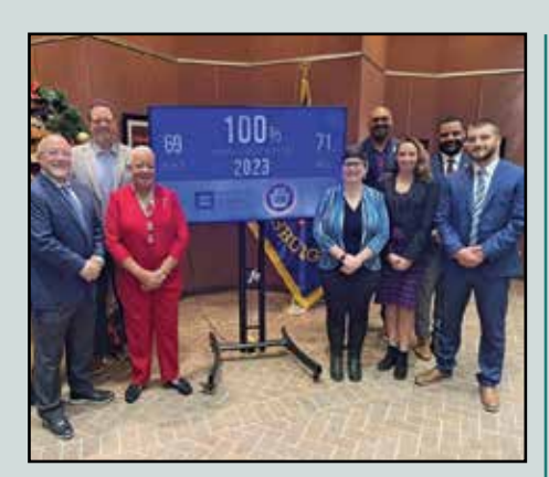
Celebrating a perfect human equality index rating with the city of Harrisburg!