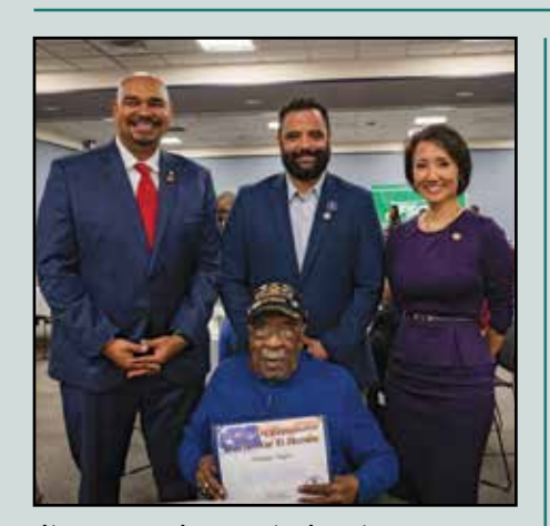
It was an honor to host a Veterans Day Breakfast with my colleagues to express our gratitude to the heroes who have served our nation.