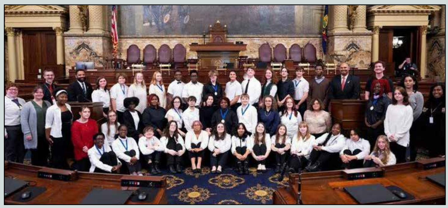
I had the pleasure of hosting Central Dauphin East's Marching Panthers in the Capitol to celebrate their recent victory in the USBands National Championships!