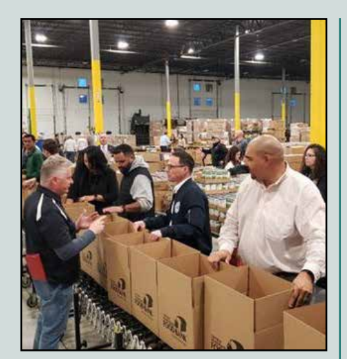
Volunteering with Gov. Josh Shapiro at our local food bank!